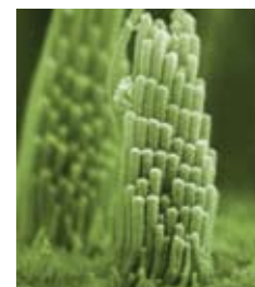
Figure 2: Intestinal Villi

“The problem is that foods rich in nucleotides are now rarely on our menu. Meat products from organs such as liver, kidney, intestines and lung are particularly rich sources of nucleotides, but are now rarely eaten.”